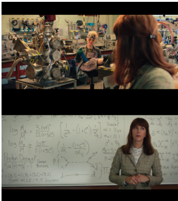
Picture 2. Other three members at their work place as scientists