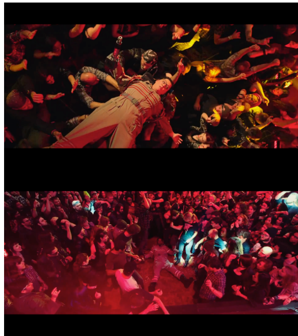
Picture 4. The crowd want to carry Abby but not Patty

In addition, the fact that Patty left her stable payment job and chose to be a member of a paranormal scientist without any consideration itself also proves her recklessness.