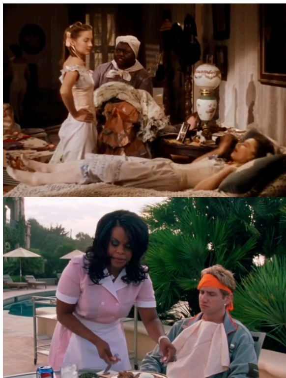
Picture 8. Mammy's archetypal: serving their white master by preparing their dresses and meals. From left, source: screenshot from Gone with The Wind (1939) and Malibu Most Wanted (2003)

This kind of image is similar with other black woman character in other movie as a mammy. The left screen capture above is the screen capture of the black character in Gone with the Wind (1939), mammy was described as black person who served a noble from her dish to her dress. While the right screen capture is the archetypal of black woman in Malibu Most Wanted (2003), the mammy also served the white rich male's lunch. Patty's archetype of mammy is a modernized type of mammy. She did not do it as literary a slave of white people. Even though the slavement period has ended, Patty's behavior was still influenced by the way black women used to be.