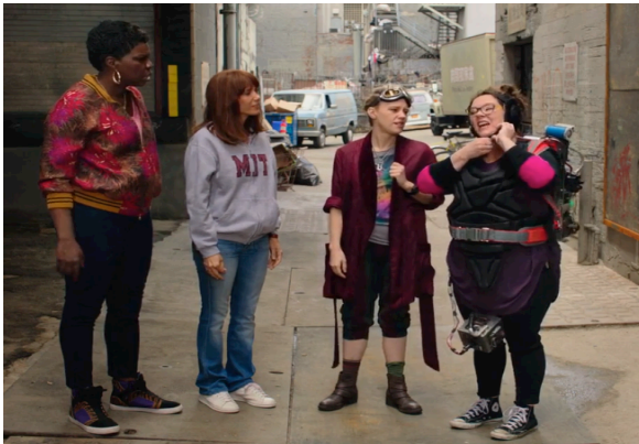
Picture 5. Patty's clothing difference from the other members' clothes.

Fashion is an object that can illustrate how crucial tensions in society. Fashion is a result from upper social classes' need to distinguish themselves from lower social classes (Godart, 2012, p. 24). That is why through fashion people can tell someone's culture and class, so does Patty's fashion compared to the other members.