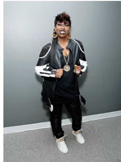
Picture 6. Missy Elliott fashion

mainly lived in by particular national or social group. Ghettos are usually crowded with poor housing conditions. This kind of condition also called as black urban ghettos. The mainstream stereotype of people who wear this kind of fashion is they seem to have a wealthy life style when in fact they are not. They want to show that they are success through brands and golds (Tribune, 1999).